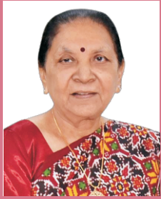
Smt. Anandiben Patel

H.E. the Governor and Chancellor, BRAUSS, Mhow, Indore (MP)